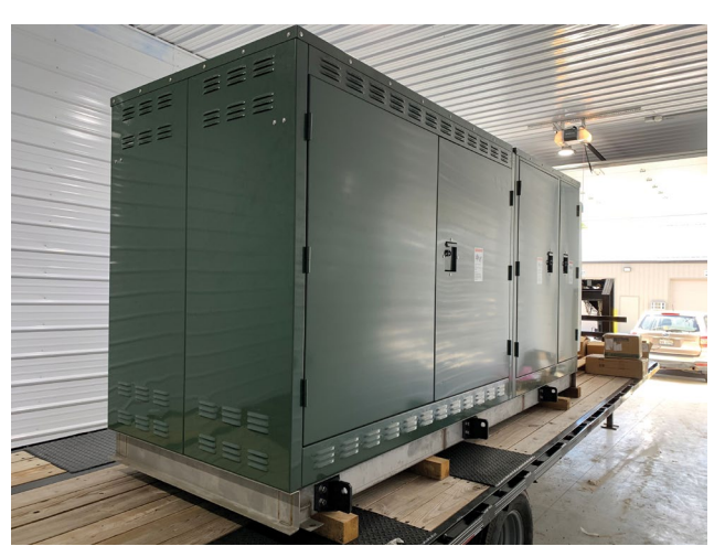
Phase-EQ device, ready for initial deployment